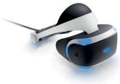
Image of Sony PlayStation VR

VR works by feeding video from a computer to the HMD or smartphone/tablet —either by cable or wirelessly. The headsets take the video feeds and send them to a single display or to two displays (one for each eye). Sometimes the lenses in an HMD are adjustable to match the distance between a user's eyes. This helps the image to be as focused and shaped as possible and facilitates a "stereoscopic" three dimensional image (created by angling the two separate two dimensional images to simulate how human eyes have small differences in the way each one views images).