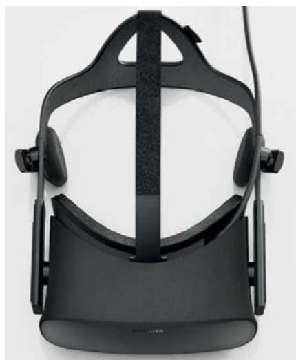
The Oculus HMD