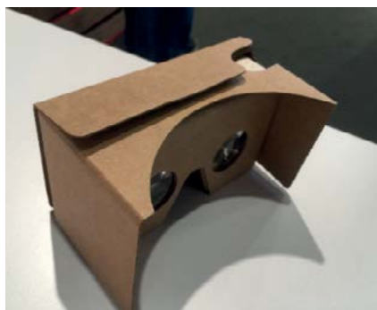
The Google Cardboard headset

Cardboard is designed specifically for using VR apps on Android smartphones and Google encourages developers to make and sell VR apps for Google Play.