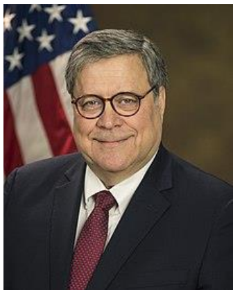
William Barr, Attorney General