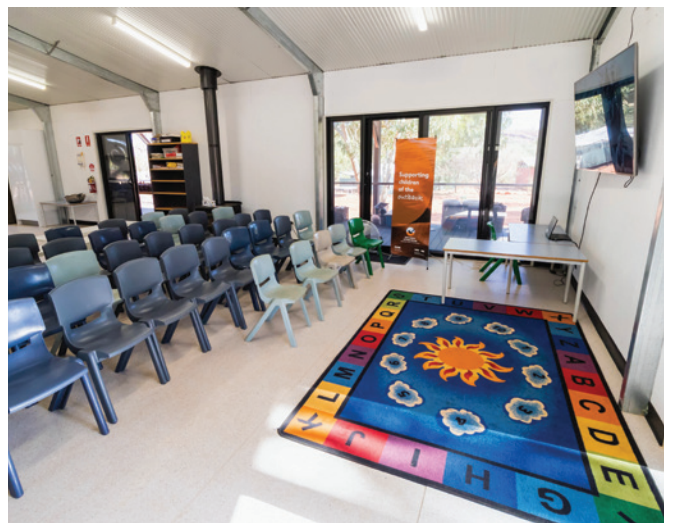
The new secondary classroom at the Watarrka School in Lilla, which opened in March 2019.